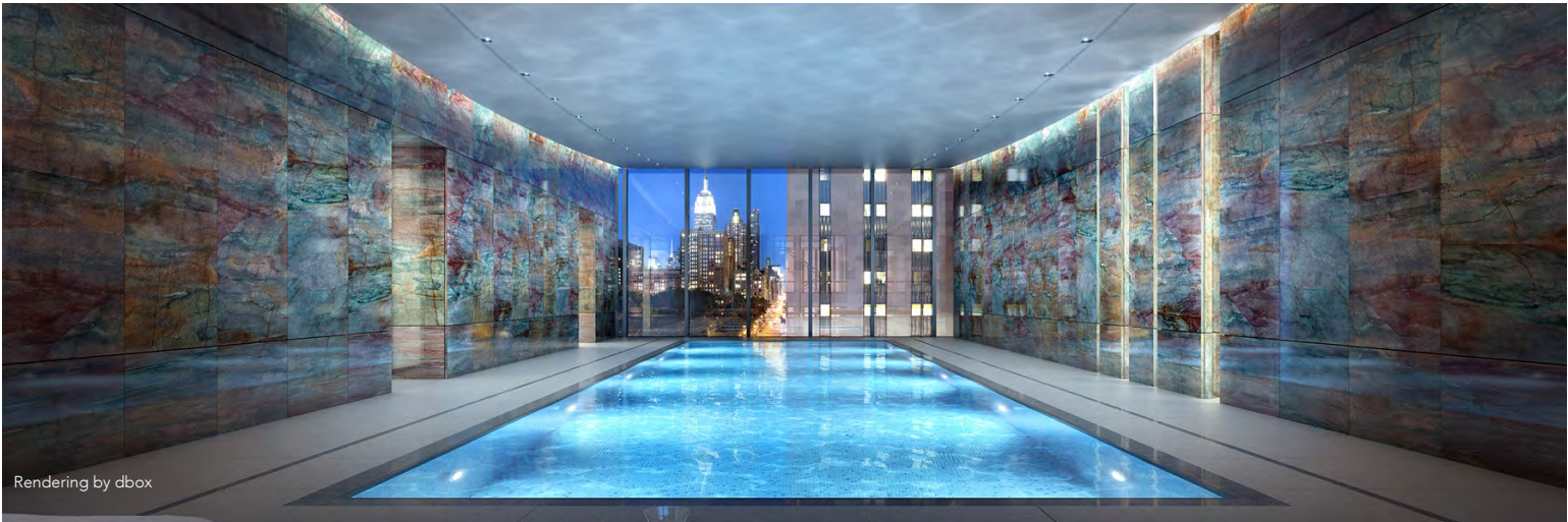
Rendering by dbox